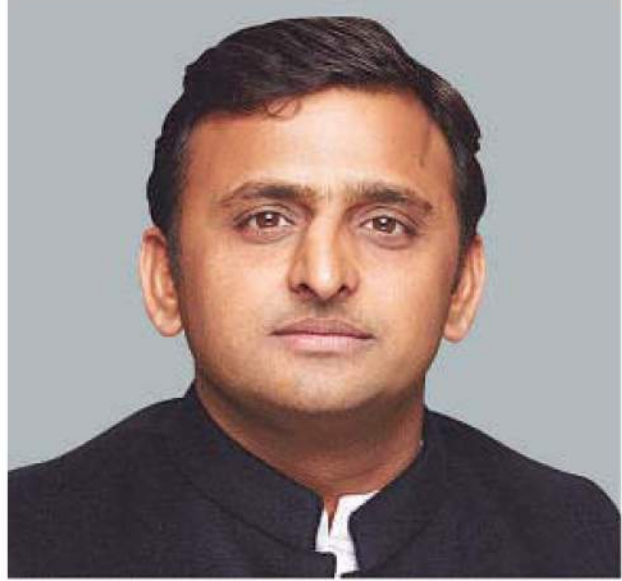
Shri Akhilesh Yadav, Hon'ble Chief Minister, U.P.

In pursuit of making Noida-Greater Noida a world-class area and a favoured destination for investment